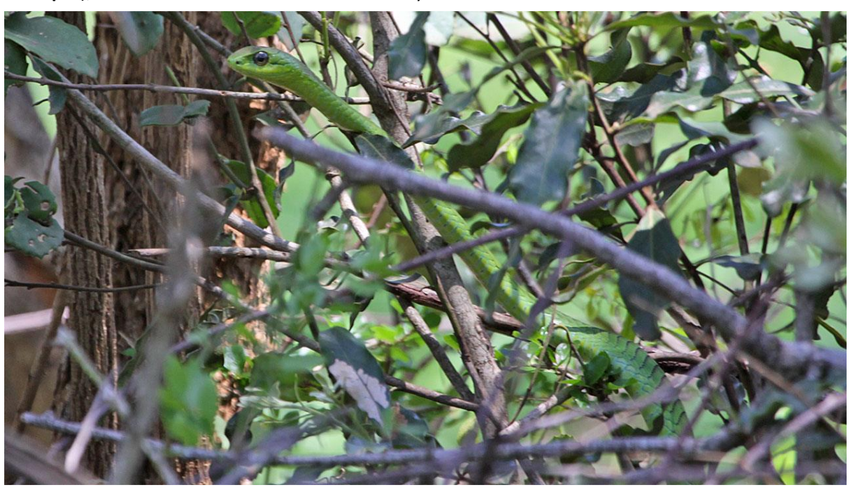
The cause of the alarm - a young male Boomslang (Dispholidus typus)

Adding to this, Mkhuze was the only place on the whole trip where the weather gods was not on our side - although we had decent weather during the morning game drives, we had some really heavy raining in the afternoons and evenings.