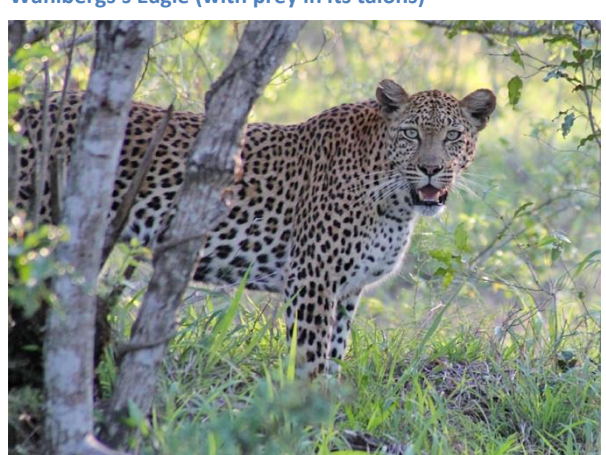
Leopard in Mkhuze

Shrike, Violet-backed Starling, Red-billed Oxpecker and Purple-banded Sunbird.