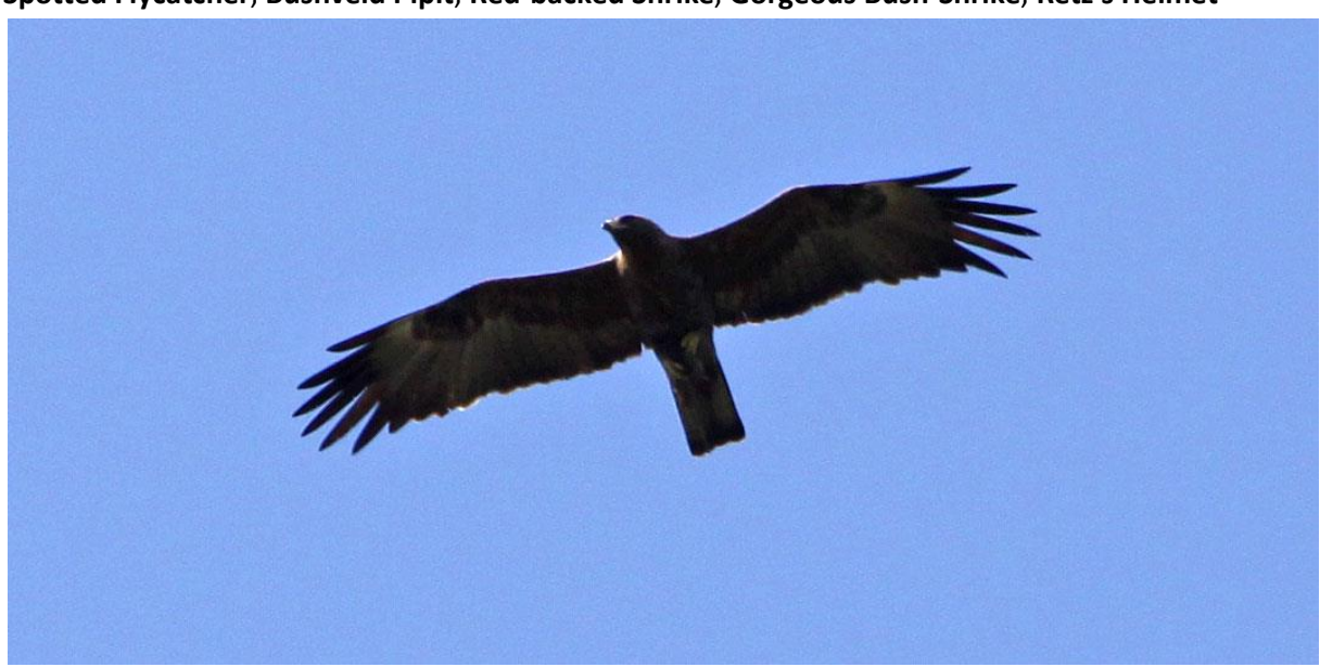
Wahlbergs's Eagle (with prey in its talons)

Spotted Flycatcher, Bushveld Pipit, Red-backed Shrike, Gorgeous Bush-Shrike, Retz's Helmet-