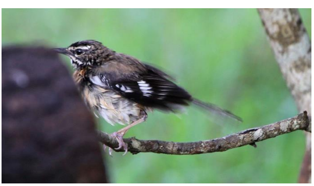
Bearded Scrub-Robin (a very wet one)

In spite of what's written above, we don't regret at all visiting the Mkhuze GR!