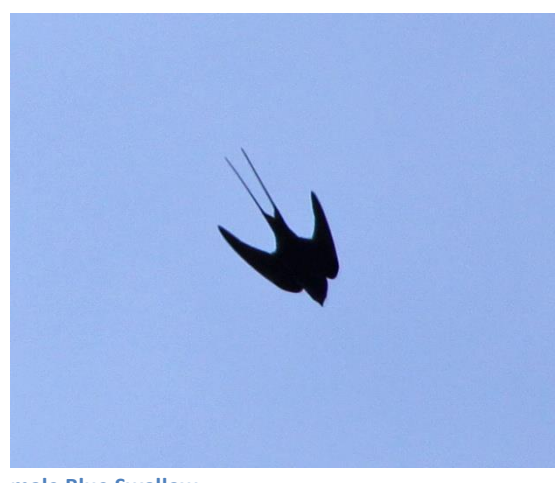
male Blue Swallow

Highover was really fantastic and also offered very good accommodation - we stayed in the Lodge. We were so very well looked after by the owners Dave and Margie Edwards. They were extremely nice and served us with lunch, snacks, diner, wine, advice, game drive and much more!