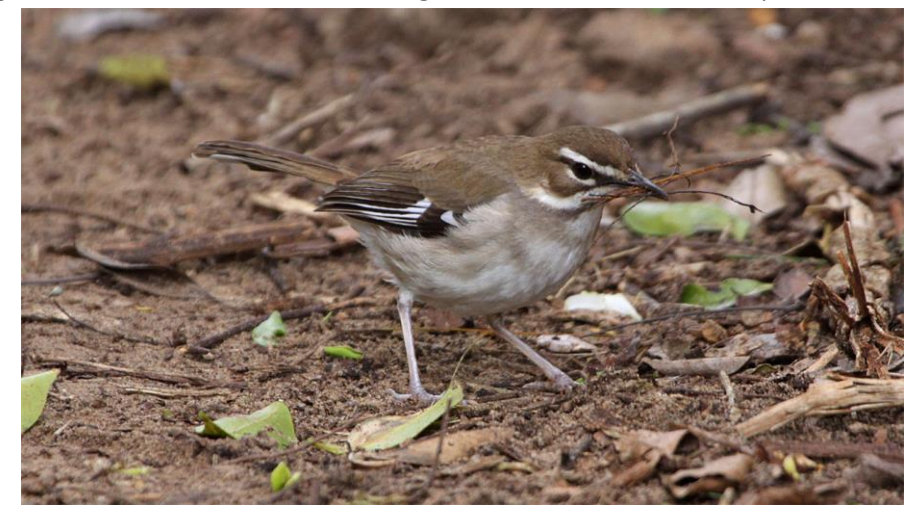
Brown Scrub-Robin along the iGwalagwala Trail

Other noteworthy species in St Lucia area: