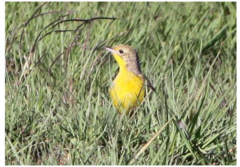
Vallay broasted Dinit