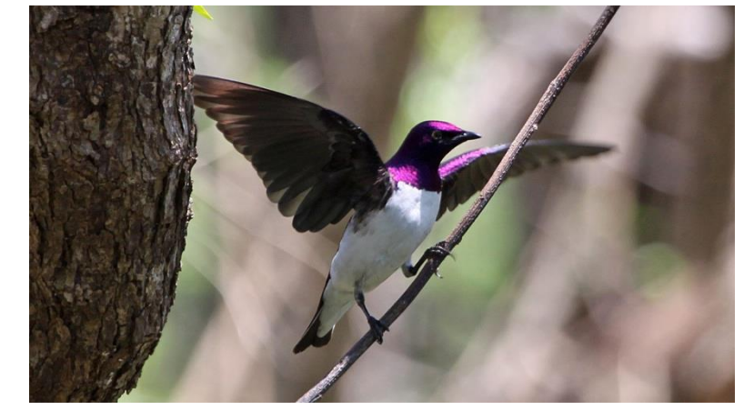
Violet-backed Starling alarming for a green snake...

Animal- and bird wise the reserve was good but maybe also slightly disappointing. We did find a Leopard ourselves while it was slowly crossing the road just in front of our car early evening and we also saw some new really nice bird species (like Neergaard's Sunbird and Pink-throated