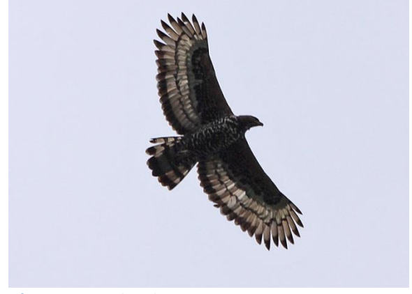
African Crowned Eagle

Chacma Baboon, Vervet Monkey, Samango Monkey, African Elephant, Burchell's Zebra,