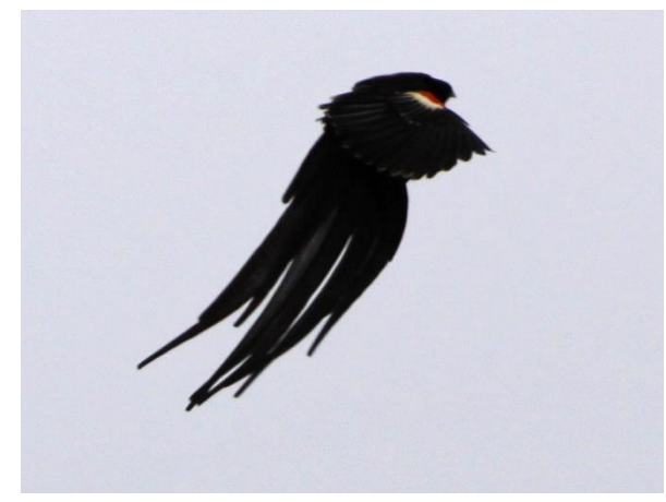
male Long-tailed Widowbird

Southern Bald Ibis, Long-crested Eagle, African Olive Pigeon, Dark-capped Yellow-Warbler, Southern Red Bishop, Long-tailed-, Red-collared- and Fan-tailed Widowbirds, Pin-tailed Whydah, Brimstone-, Yellow-fronted- and Cape Canaries.